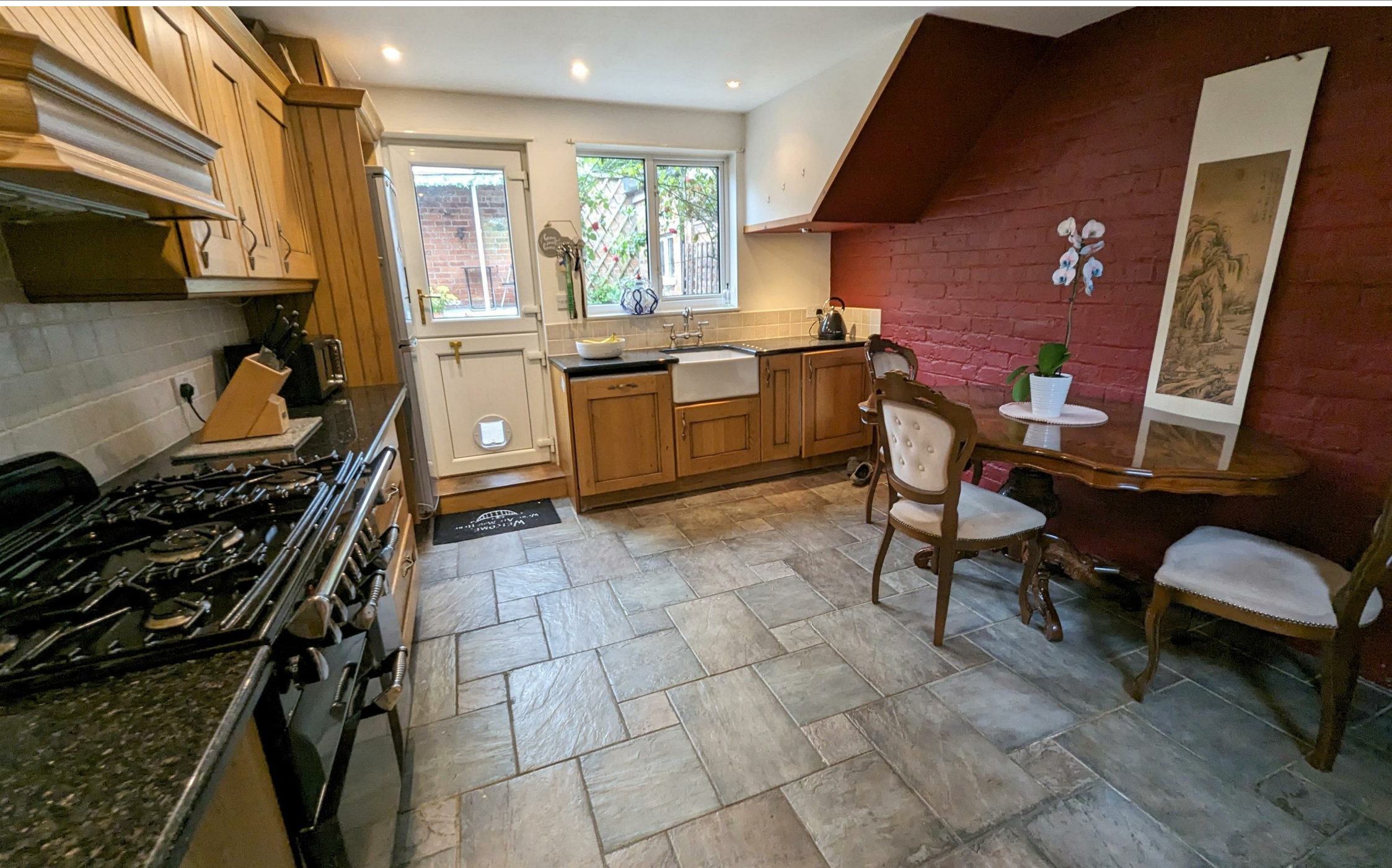
Northcote Terrace | Darlington £170,000